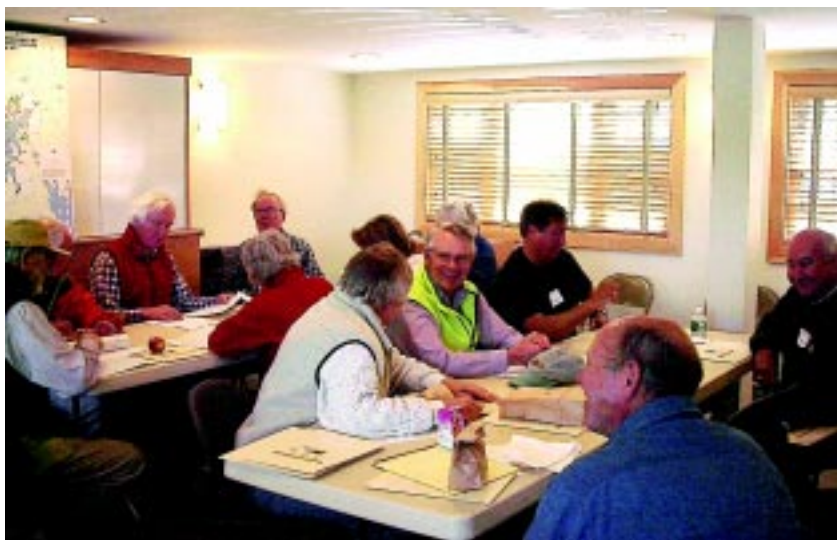
Monitor leaders and teams write up their monitoring reports after walking Piper Cove, Berry Mill, and Mill Brook.