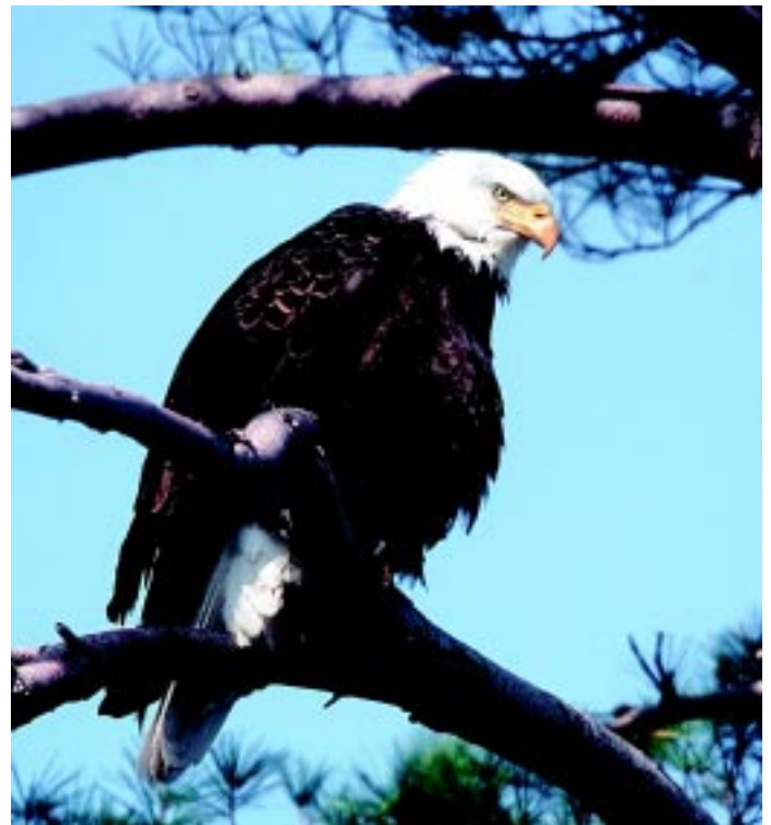
"The eagle has landed," and taken up residence for a second year on Little Loon Island.