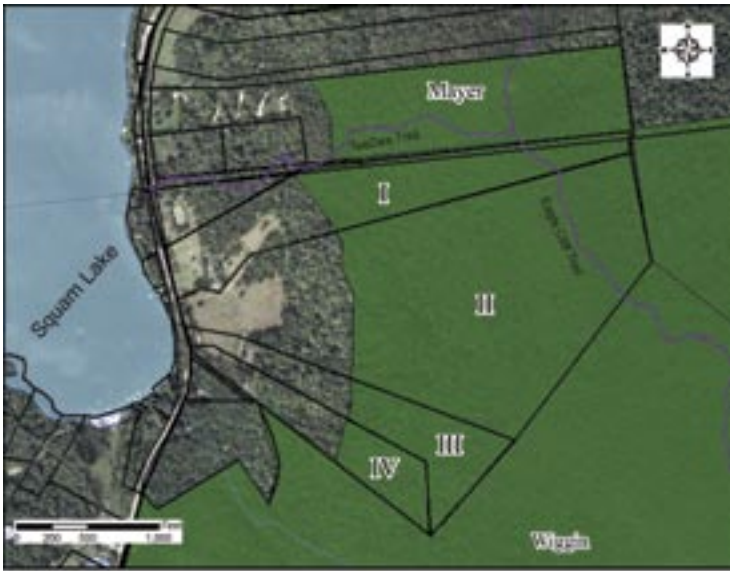
Lot lines shown are for generalized mapping purposes only.