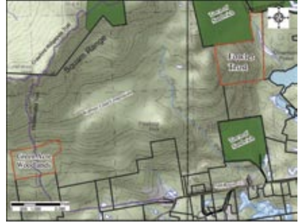
Lot lines shown are for generalized mapping purposes only, not for absolute accuracy. Map printed November 16, 2005 by the Squam Lakes Conservation Society.